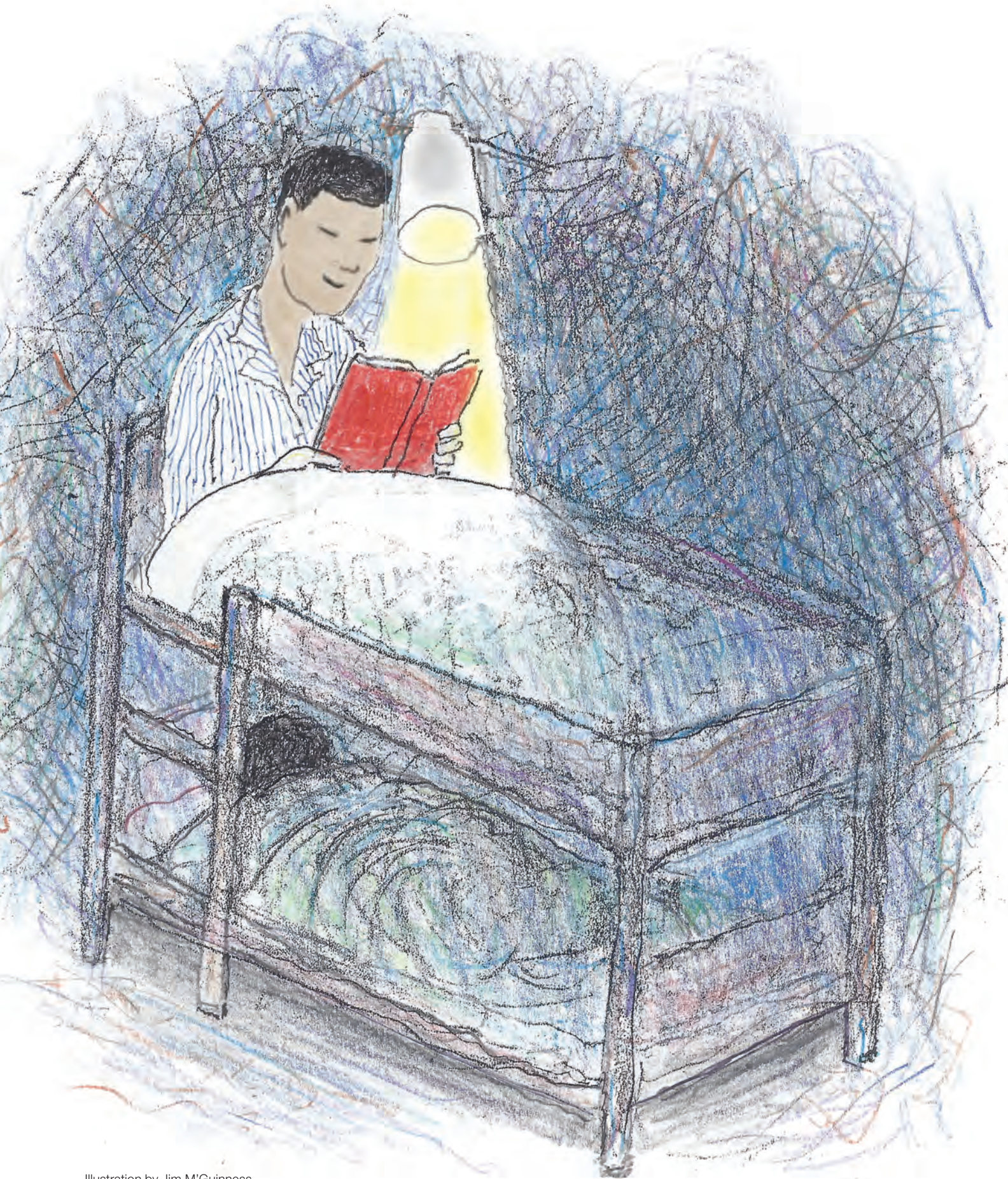
Illustration by Jim M'Guinness