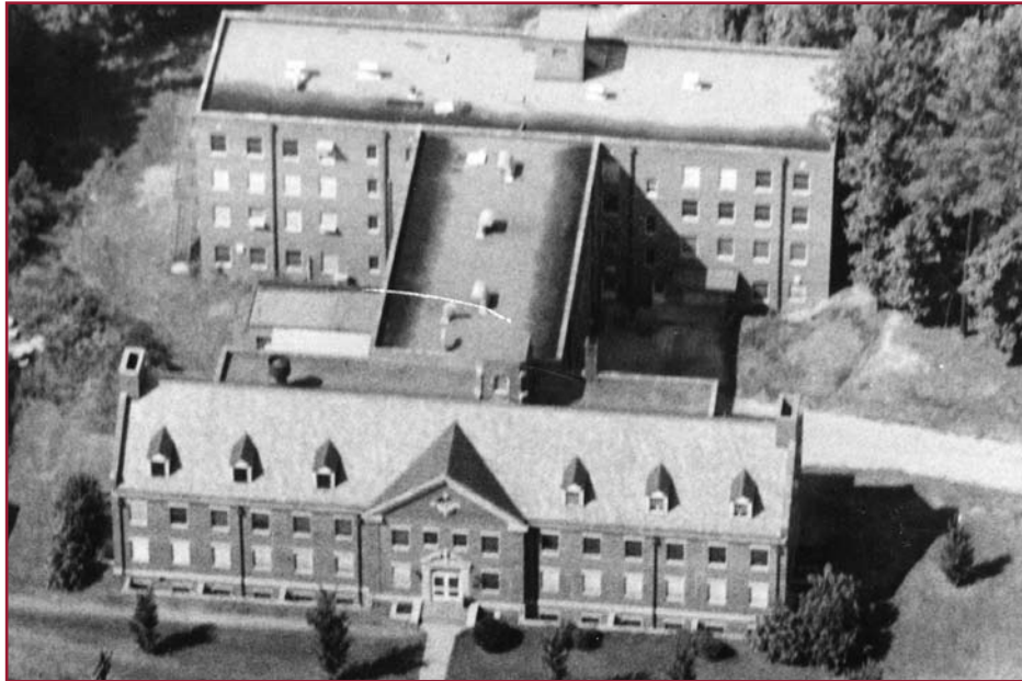
The Bell Building.

matriculated at the school and received his MD degree in 1967. In 1963, following court cases directing the desegregation of hospitals, Duke integrated its medical and surgical wards and, more slowly, its medical staff. 1,2,3 The separate cafeterias for black and white employees were merged. 10